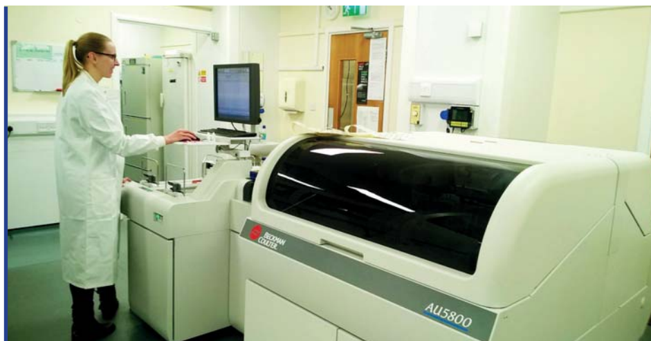
Christina Gabris validates fCAL turbo on the Beckman Coulter AU5800

For a complete list of validated protocols for the fCAL turbo assay please visit: www.alphalabs.co.uk/turbo-applications